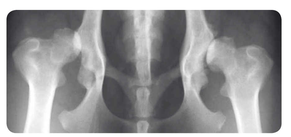
Severe hip dysplasia (total score 93). The right hip (on the left of the picture) has slipped out the socket (the acetabulum). This hip has dislocated because the socket is so shallow. The left hip (on the right of the picture) is just in the socket, but the socket is again very shallow and has been completely remodelled. There is more new bone around the left hip joint (osteoarthritis) than around the right.

As HD can include joint looseness (laxity), inflammation, pain, new bone formation and bone erosion, it may cause a range of observable signs from normal to minor changes in gait (in the mildly affected